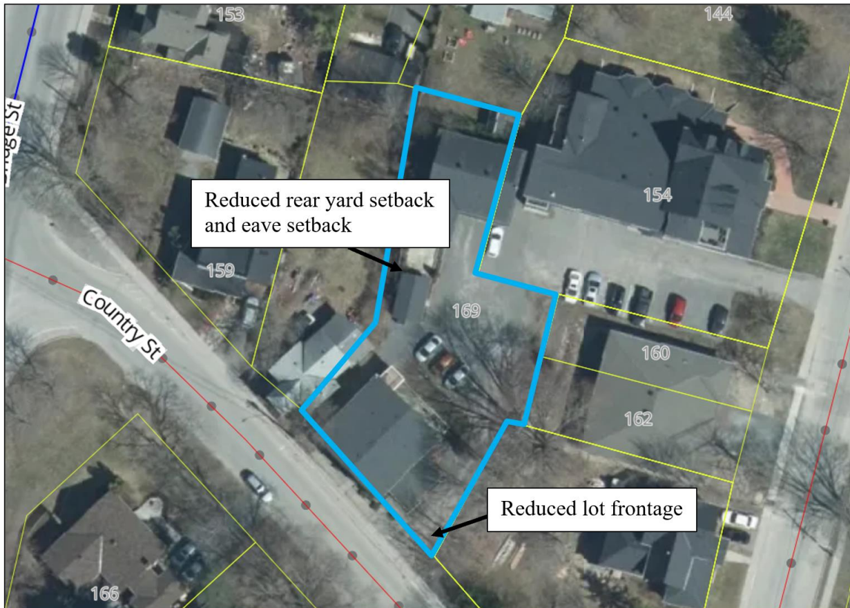
Figure 1 – Aerial Image of Subject Property

Figure 1 shows an aerial image of the subject property.