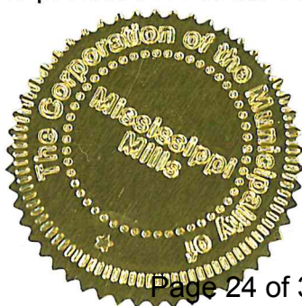
Christa Lowry Mayor Mississippi Mills

NOW THEREFORE , be it resolved that the Municipality of Mississippi Mills recognizes the 30th anniversary of World Oceans Day on June 8th, 2022 and supports national and international efforts to protect 30% of the ocean by 2030.